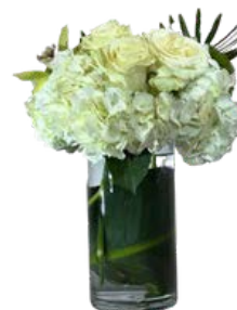
V 16-18" tall x 10" wide $150.00 each