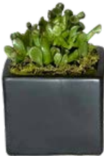
F1 6" tall x 4" wide $60.00 each