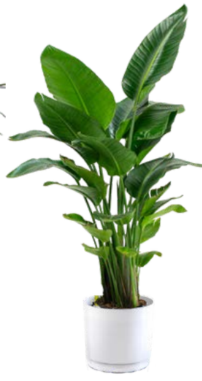
Bird of Paradise 4 - 6'