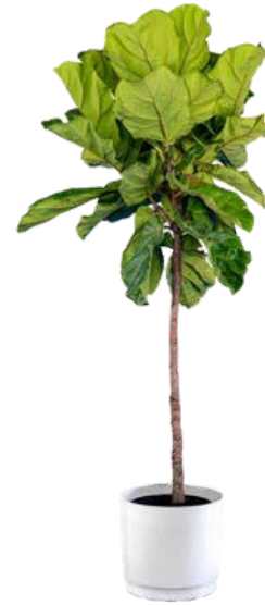
Fiddle Fig Tree 4 - 6'