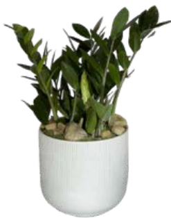
H 10-14" tall x 11 x 5-6" wide $75.00 each