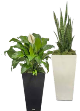
Option 4: Regal Urn 15" Square x 30" Tall 2-3' full green plant potted in black or white urn