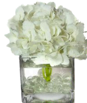
G1 6" tall x 5" wide $60.00 each