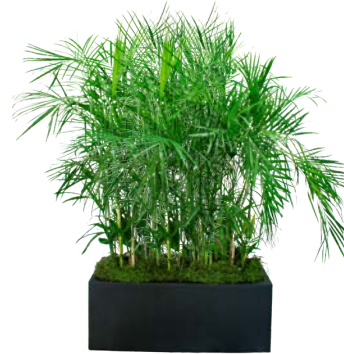
Option 3: Pavilion Planter 38" Long x 16" Tall x 14" Wide Filled with three 5-6' palms top-dressed with moss in black or white planter