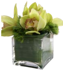
C 6" tall x 5" wide $75.00 each