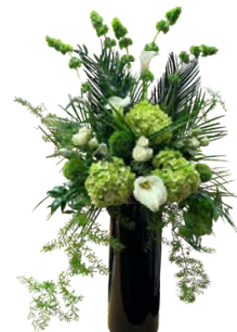
Z 20-24" tall x 16-18" wide $275.00 each

Custom Floral Arrangements are also available, please reach out to our design team for a quote!