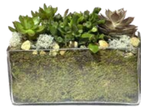
J2 7" tall x 8" wide $100.00 each

Custom Floral Arrangements are also available, please reach out to our design team for a quote!