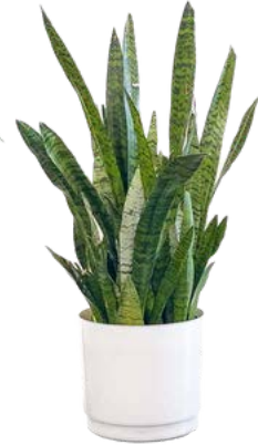
Snake Plant 2-3'