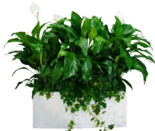
Option 2: Pavilion Planter 38" Long x 16" Tall x 14" Wide Filled with 2-3' Green plants top-dressed with trailing green plant in black or white planter