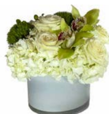
Q 12" tall x 12-14" wide $135.00 each