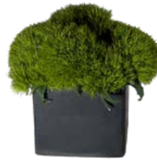
E1 6" tall x 5" wide $75.00 each