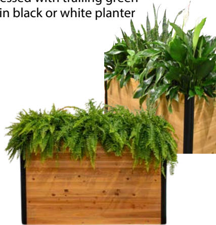
Option 6: Cedar Planter 56" Long x 32" Tall x 16" Wide Filled with 2-3' Green plants top- dressed with moss