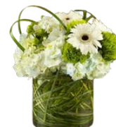
N 12" tall x 12" wide $125.00 each