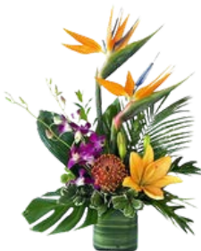
T 16-18" tall by 10-12" wide $150.00 each