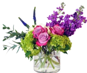
O 12" tall x 12-14" wide $135.00 each