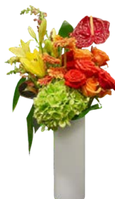
U 16-18" tall x 10" wide $150.00 each