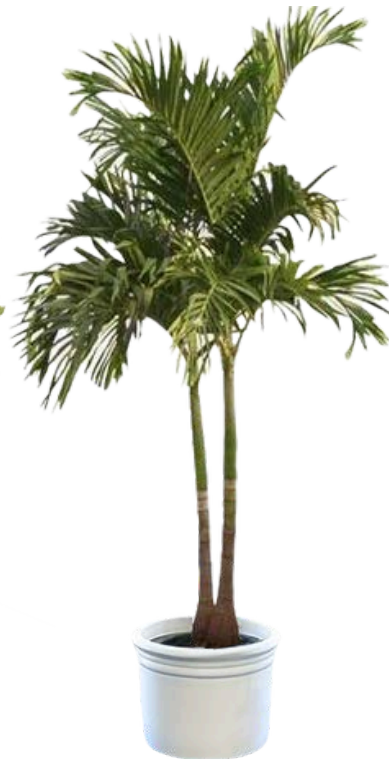
Adonidia Palm 10 - 16'

*Discount pricing only applies to orders received and paid in full thirty days prior to Exhibitor Move In*