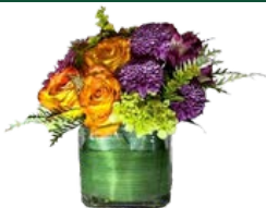
L 10" tall x 10" wide $95.00 each