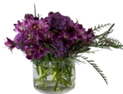
M 10" tall x 10" wide $95.00 each