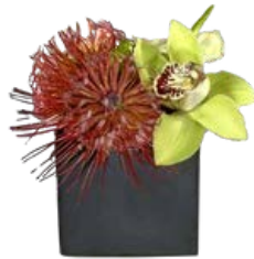
D 6" tall x 5" wide $75.00 each