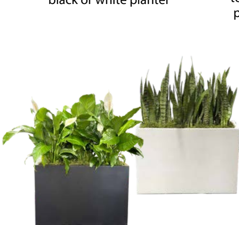
Option 5: Soho Planter 36" Long x 24" Tall x 10" Wide Filled with 2-3' Green plants top-dressed with moss in a black or white planter