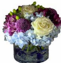
P 12" tall x 12-14" wide $135.00 each