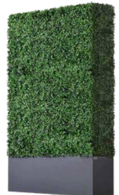
Option 8 7' tall x 4' wide Faux Boxwood Hedge

*Discount pricing only applies to orders received and paid in full thirty days prior to Exhibitor Move In*