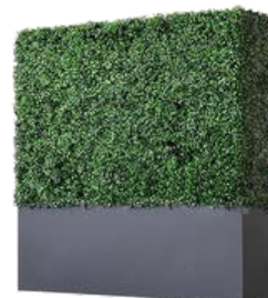
Option 7 4' tall x 4' wide Faux Boxwood Hedge