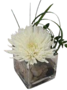
A3 4" square $45.00 each