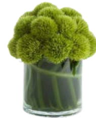
G3 6" tall x 5" wide $75.00 each