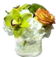
K 8" tall x 8" wide $95.00 each

PROFESSIONAL FLORAL DESIGNS A-Z: ORDER ON PAGE 6