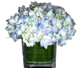
G2 6" tall x 5" wide $60.00 each