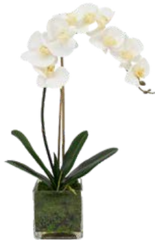
I 16" tall x 10" wide $95.00 each