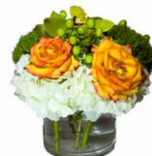
R 12" tall x 12-14" wide $135.00 each