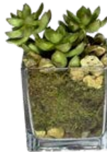
F2 6" tall x 4" wide $60.00 each