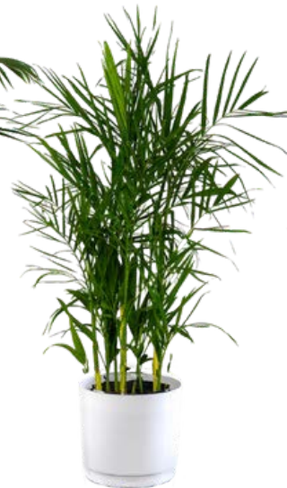
Bamboo Palm 4 - 6'