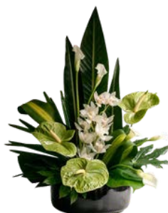
Y 18" tall x 14" wide $175.00 each