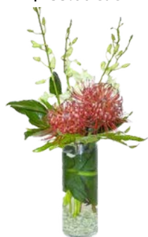
S 6-18" tall x 6" wide $135.00 each