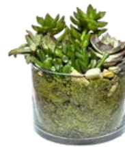
J1 7" tall x 6" wide $95.00 each