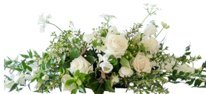
X 10" tall by 18-20" wide $150.00 each