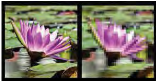
High Resolution (300 dpi)

* All fonts within the artwork need to be converted to outlines.